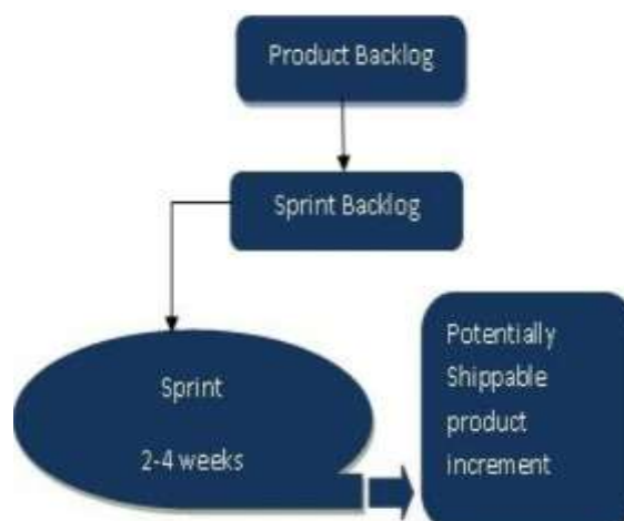
Figure 2: Scrum Methodology

Scrum is another methodology for developing software that is lightweight. Scrum introduced the idea of empirical process control—the only real distinction between theory and practice—instead than the other way around [13]. In Scrum, the projects are broken into small working units that are referred to as the sprints that are normally one to three weeks [14]. Scrum methodology phases are shown in figure 2.